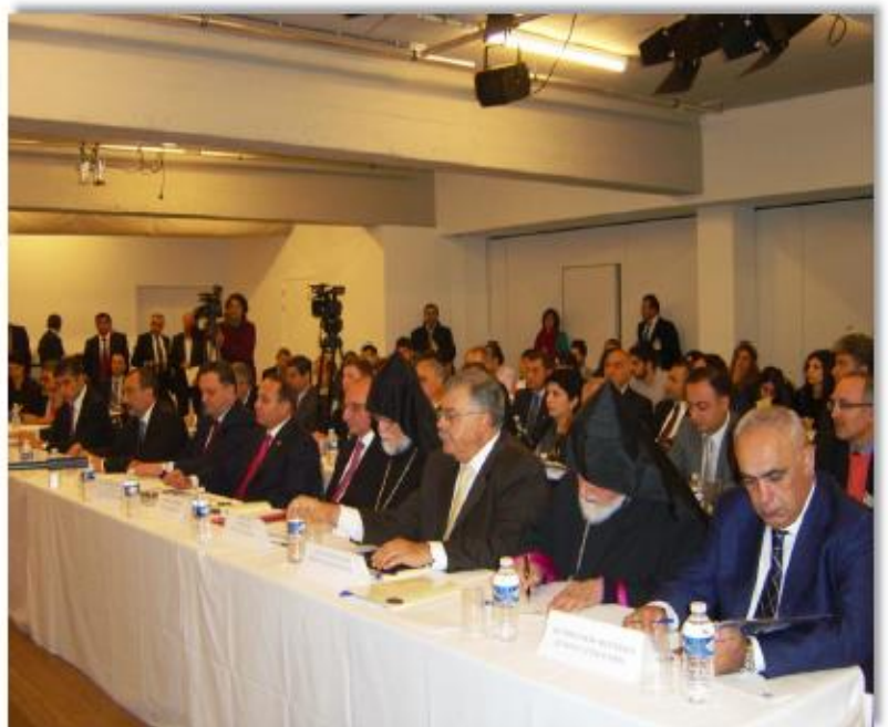
Participants of the 3rd European Armenian convention, Armenian Community Center, October 2013

His Holiness Catholicos Aram I of the Holy See of Cilicia, the President of the Republic of Artsakh Bako Sahakyan, the Speaker of the National Assembly of the Republic of Armenia at the time, Hovik Abrahamyan, , ambassadors and representatives of Armenian organizations in Europe as well as 350 Armenian delegates from Europe participated in the conference. The 4th European Armenian Convention is to be held in October, 2017 in Brussels.