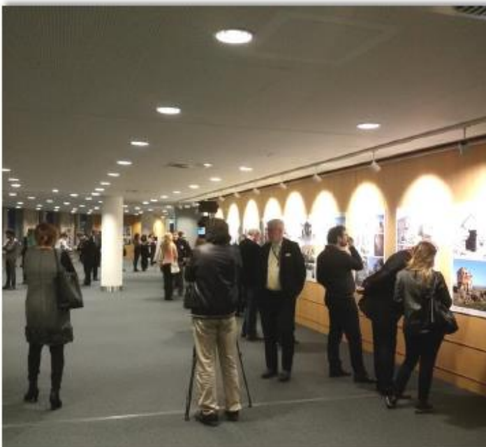
“Genocide After Genocide” exhibition, European Parliament, March 2016