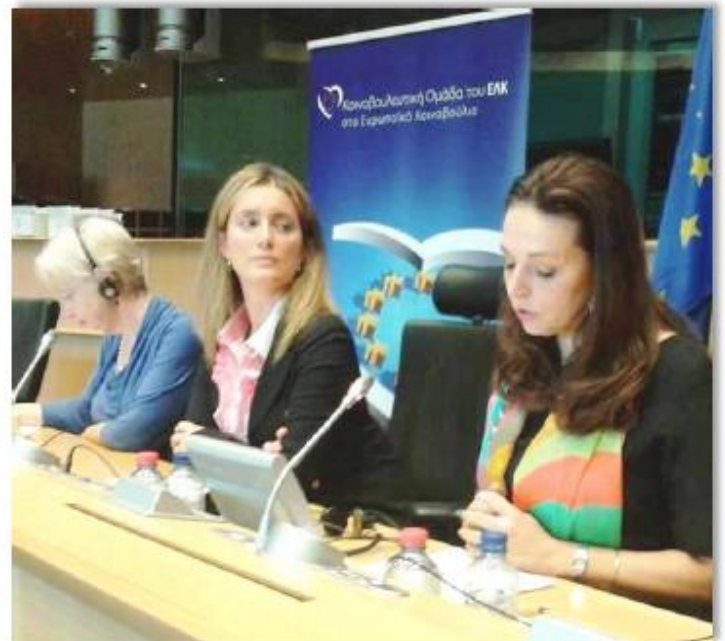
MEP Theocharous and French MP Boyer during the conference “A bridge for the reconciliation of nations”, European Parliament, May 2013