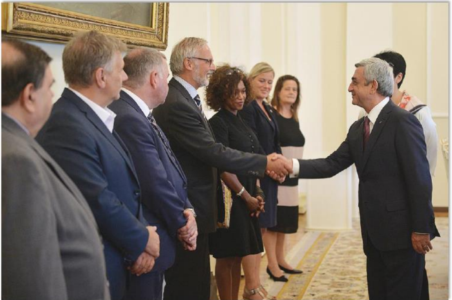
Members of the Belgian Parliament meeting President of Armenia Serge Sarkisian, Yerevan, September 2015

The participants of these delegations also pay visits to cultural and historical monuments of both Armenian Republics, educational centers, factories and communicate with common people in the streets, etc.