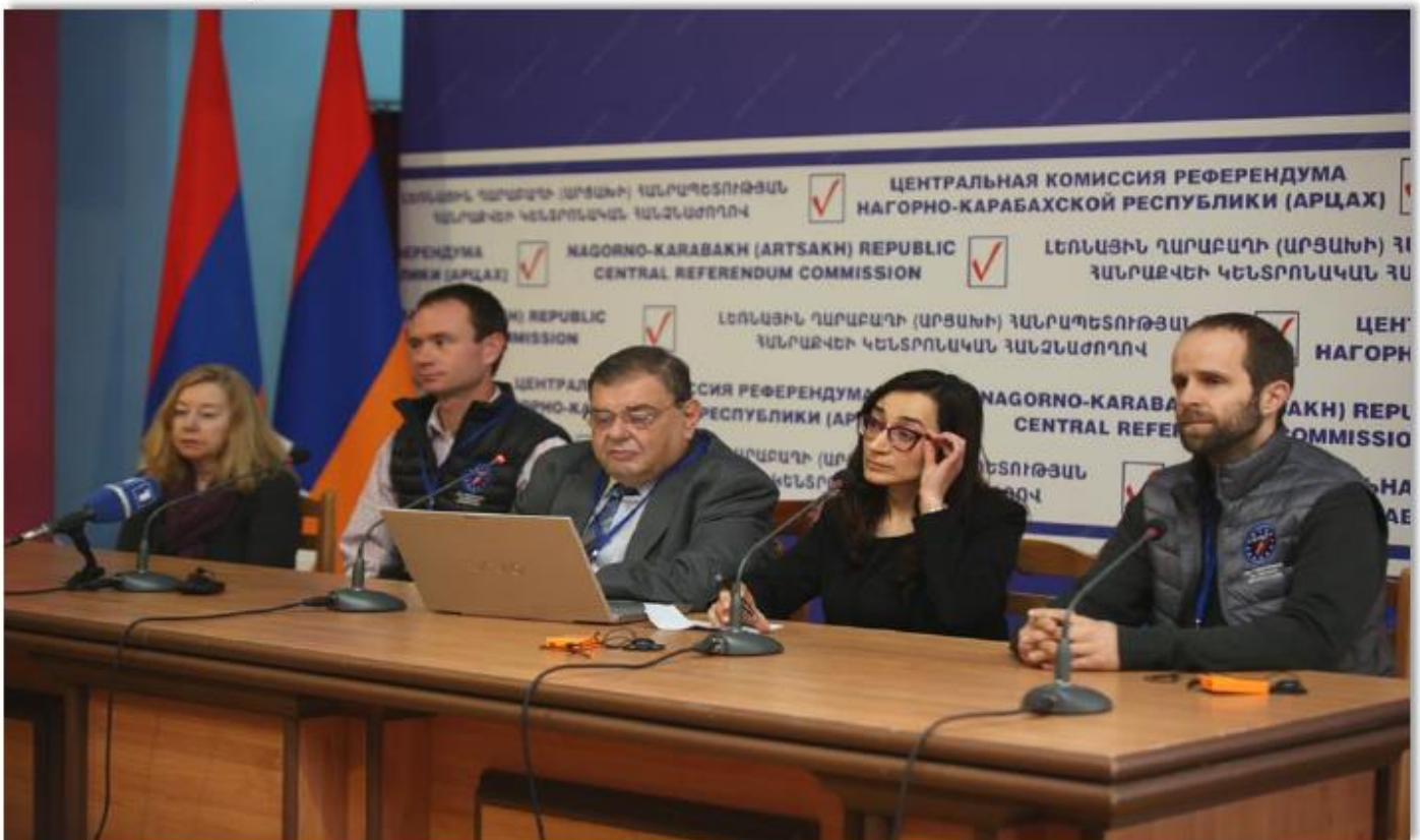
STO members during a press conference to present the report on the referendum on the Constitution, Stepanakert, February 2017

In February 2017, EAFJD deployed another STO-mission in Nagorno-Karabakh, to observe the referendum on the draft Constitution of the Republic of Artsakh. The mission consisted of eight professional independent observers from Spain, the United Kingdom, Slovakia, Romania, Latvia, and Slovenia. Four teams covered 48 polling precincts in all eleven constituencies in Artsakh and issued a report based on their findings.