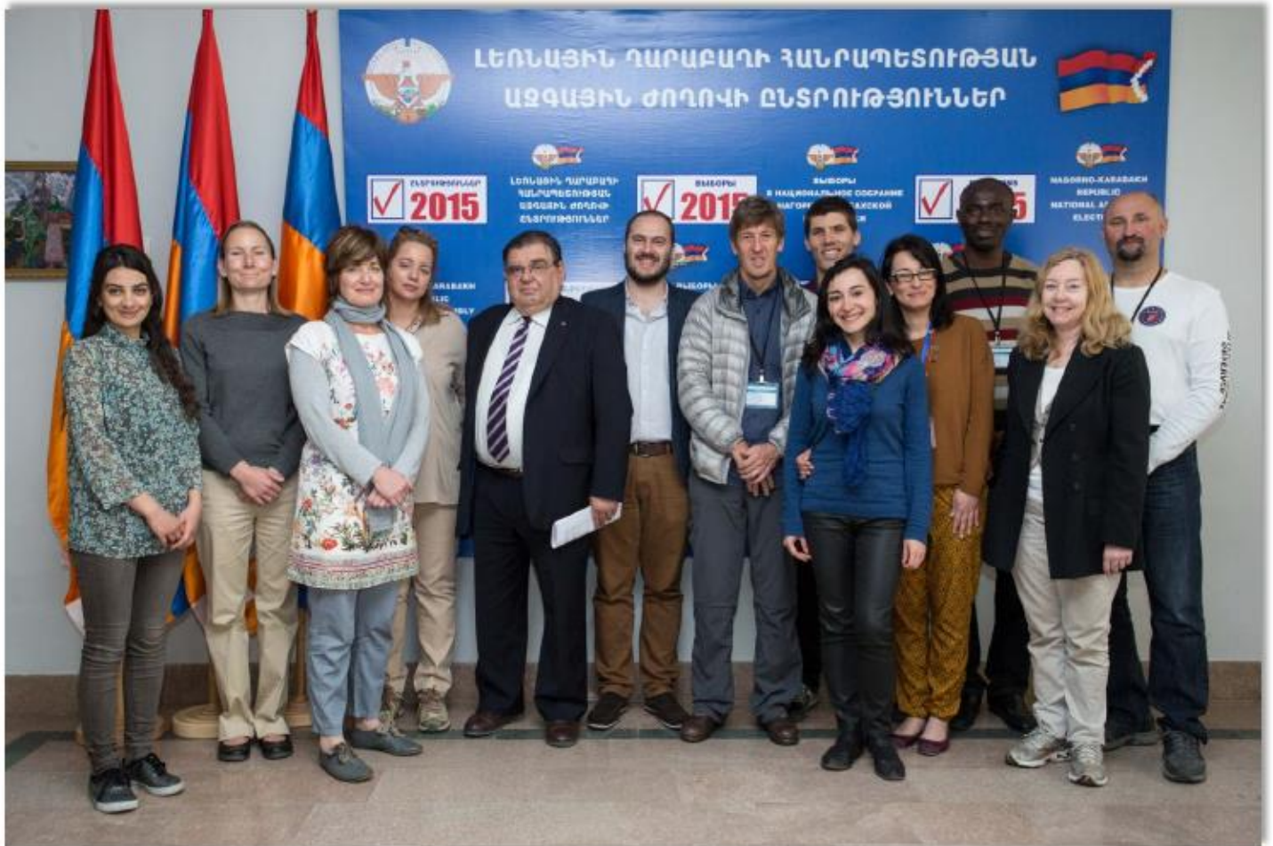
Independent international observers monitoring the elections in Artsakh, Stepanakert, May 2015

Before visiting polling precincts, the short-term observers of both missions had a chance to have a Q&A session with the Central Electoral Commission of Republic of Artsakh and meet representatives of the civil society. Both missions followed the methodological guidelines and code of conduct established for OSCE election observation missions as well as those enshrined in the Declaration of Principles for International Election Observation and Code of Conduct adopted by the United Nations in 2005. The short-term observers of both missions reported transparent, well-organized and orderly electoral process.