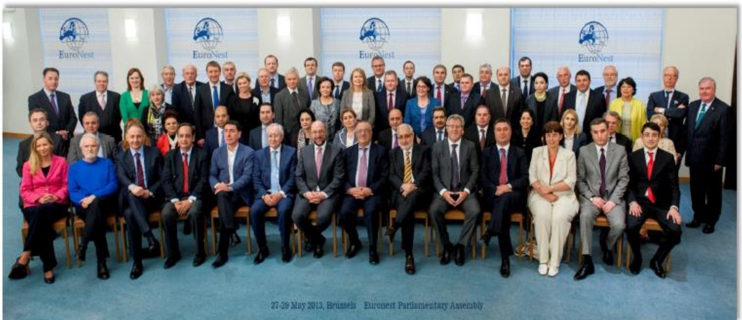
Euronest Parliamentary Assembly plenary session, Brussels, May 2013

The Federation is often present in those plenary sessions, mobilizing its chapters in all countries and assisting the work of the Armenian delegation