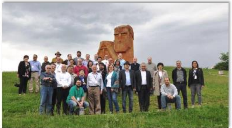
International ANC Congress, Stepanakert, May 2016

EAFJD organizes and participates in the annual meetings of the Committees of the Defense of the Armenian Cause in Europe and International. In the period of 2013-2017 new Committees were formed in several European countries.