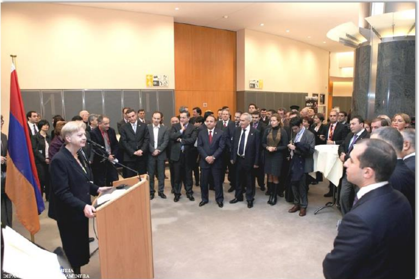
EU-Armenia Friendship Group in the European Parliament, Brussels, January 2013

EAFJD initiated the formation of the EU – Armenia Friendship Group in the European Parliament, which was launched in January 2013, with the presence of the Republic of Armenia National Assembly Speaker at the time, Mr. Hovik Abrahamyan and a large number of deputies. The EU - Armenia Friendship Group is currently presided by Cypriote MEP Dr. Eleni Theocharous.