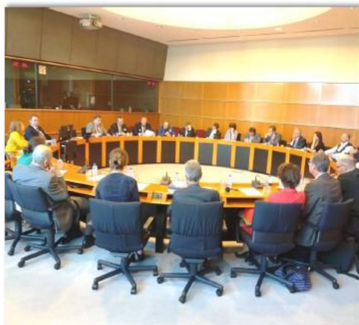
Artsakh Minister of Foreign Affairs Karen Mirzoyan and a group of parliamentarians hosted in European Parliament, September 2016