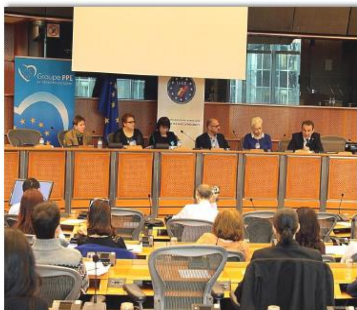
“Journalists’ eyewitness accounts during armed conflicts: the case of Nagorno-Karabakh”, European Parliament, November 2015