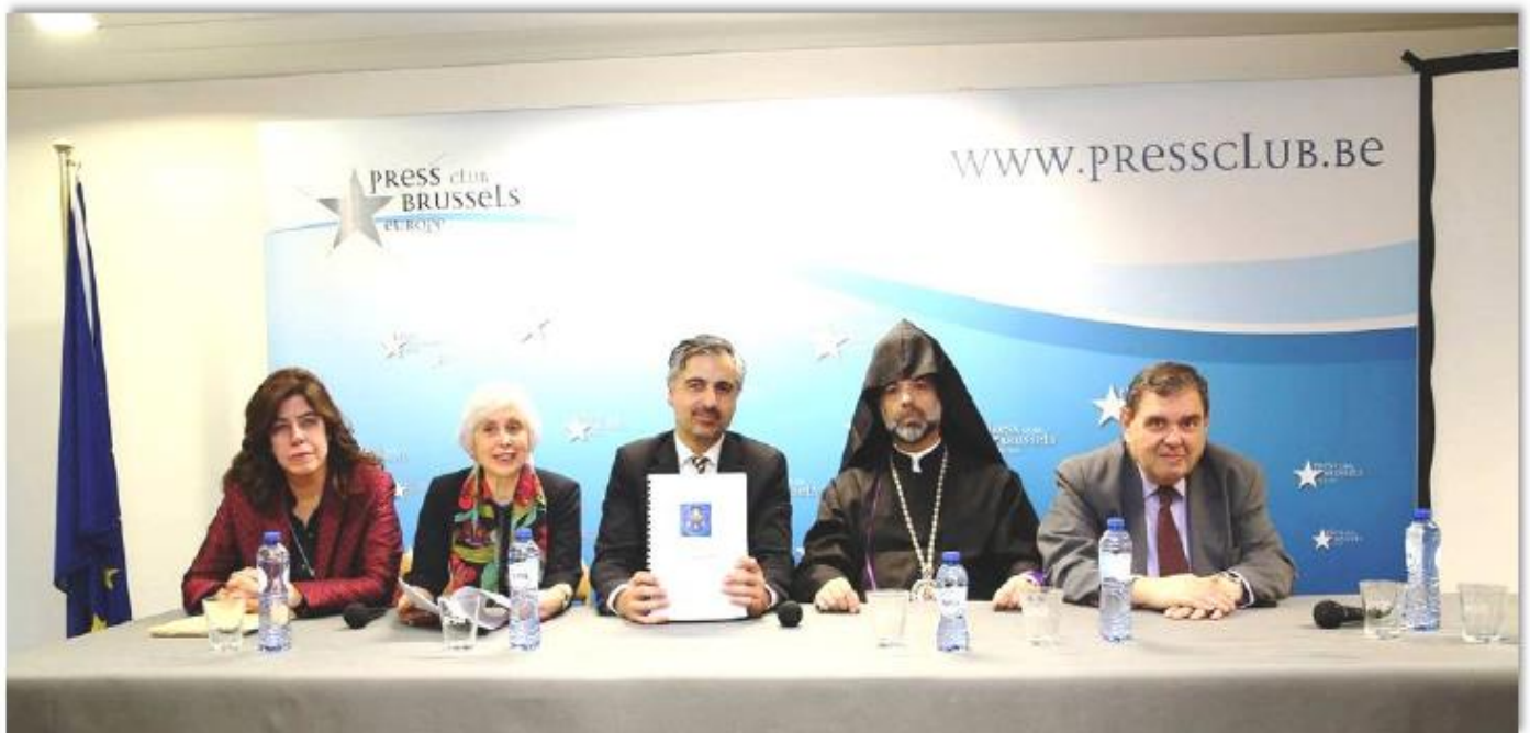
Press conference initiated by the Catholicos of the Holy See of Cilicia and organized by EAFJD, Brussels, December 2016.